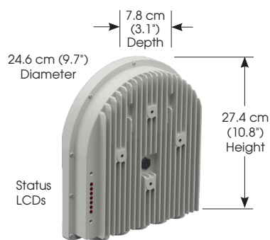
HaulPass V10g Rear View