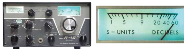
Figure 1. Traditional Receiver and S-Meter

This meant that a strong received signal indicated a higher AGC signal (also known as the automatic volume control or AVC signal). Often, this signal was also used to drive a front panel meter to indicate the received signal strength, hence the name "S-meter".